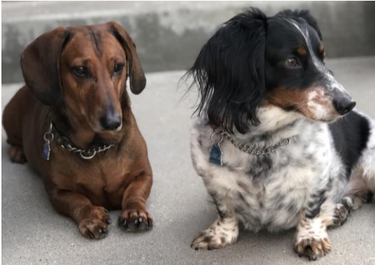
Jeffrey on the left, Rudy (formerly Bandit) on the right