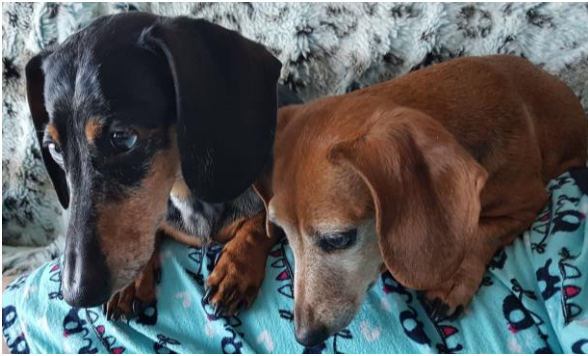
Max (formerly Gimli) on the left, Toby on the right