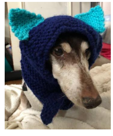
Here's Stitch wearing the adorable snood his foster mom made for him. How cute is that?

Stitch is the sweet 15-year old who was found living with squatters in an abandoned house. His cough's improved, but he's now dealing with low red blood cells and very high white ones. We're working with his vet and following him closely to try to figure out what's happening.