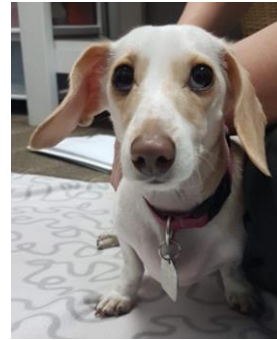
Khaleesi – adoption pending finalization of paperwork