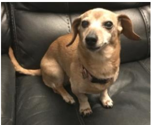
Brooke – adoption pending finalization of paperwork